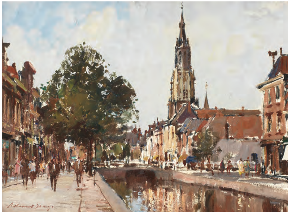
Edward Seago THE TURFMARKT DELFT